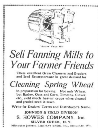
Above: Advertisement in 1928 promoting Racine fanning mill. A good fanning mill was touted as a first class investment. Seed cleaning eliminated weed seeds and dockage and ensured a better market price as well as better crops. Right: The Chatham fanning mill sold by Massey Mfg. Co., in Ontario in 1894.

The following advertisement is for Fanning Mill Sieves (or Screens) being sold in Brockport by F.F, Capen who engaged in the sale of agriculture implements during the 1850's.